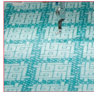
Built-in Sashiko and Wedding designs