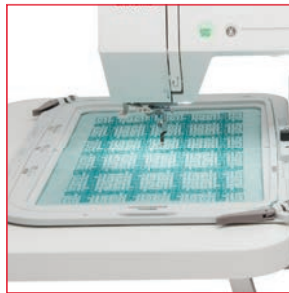
Maximum Embroidery Size: 7.9" x 14"